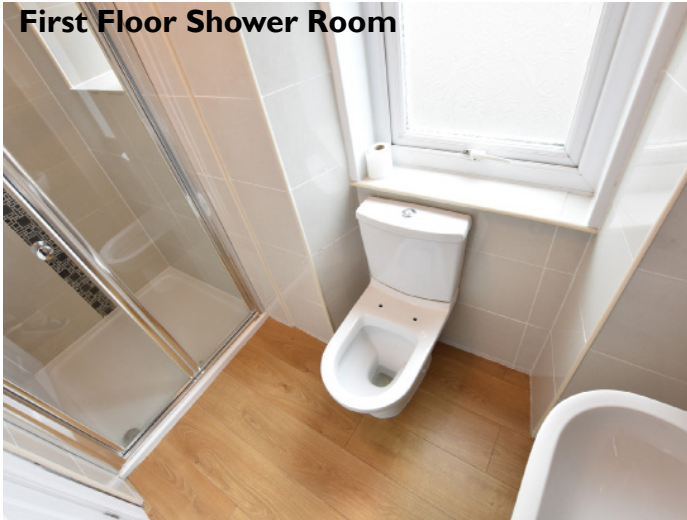
First Floor Shower Room